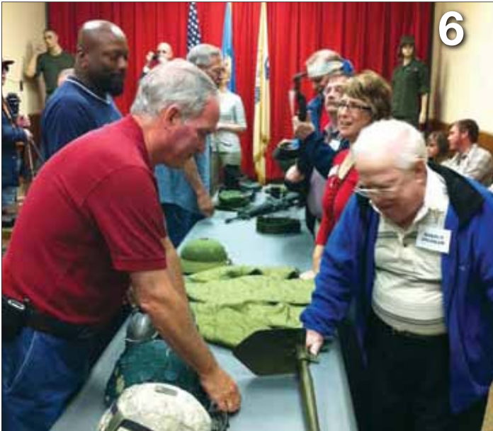
NewView Oklahoma's veterans support group participants enjoy a hands-on tour of artifacts at the 45th Infantry Division Museum in Oklahoma City.

2 We Salute You Letter from the President