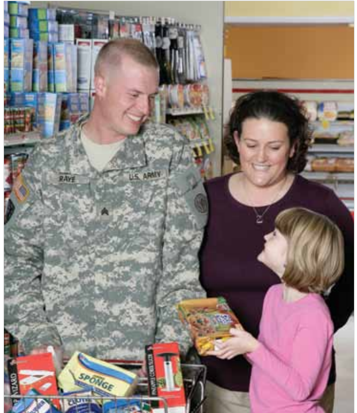
Military family stocks up on SKILCRAFT products at a commissary.

Distribution is handled through S&K Sales Co., an experienced broker providing brand-name consumer products to the worldwide military resale market. The broker assists in calling on DeCA, introducing new items into stores, managing the shelf stockers, overseeing merchandising, setting up and maintaining promotional displays and dealing with distributors to ensure they carry SKILCRAFT products. S&K Sales Co. also acts as a liaison between NIB and store personnel, educating the military on the benefits of the AbilityOne® Program.