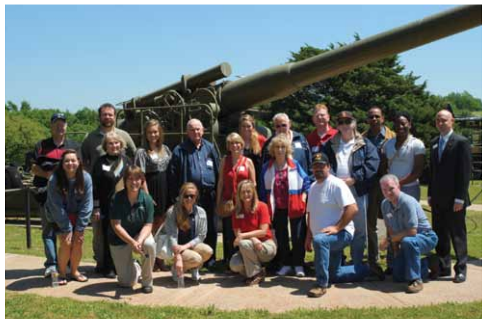
Veterans in NewView Oklahoma's VITAL support group, along with volunteers, visited Fort Sill, Oklahoma.