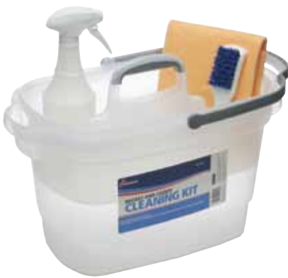
SKILCRAFT bucket and caddy cleaning kit.

In recent years, NIB has been working with its associated agencies to develop environmentally friendly products, new product categories and upgrading the current product selection, so that SKILCRAFT products continue to meet customer demand and pricing achieves the savings customers seek. In addition, product packaging and merchandising have been an ongoing activity to appeal to customers.