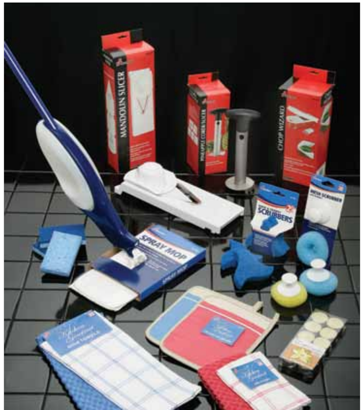
Variety of SKILCRAFT kitchen and cleaning products produced by NIB associated agencies.